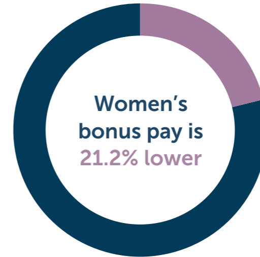
Mean Bonus Gap