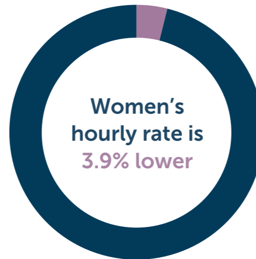
Median Pay Gap